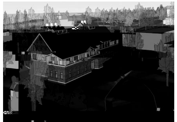
Hershey Laboratory site rendering